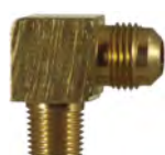
#8 Male JIC Elbow Union