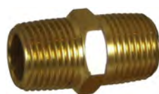
#27 Hex Nipple