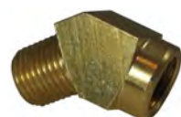
#25D 45° M&F Elbow