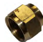
#56 JIC Flare Cap