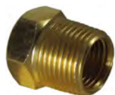
#24 Reducing Bush