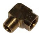
#25EL M&F Elbow