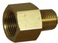
#72 (Cont) M&F Adaptor