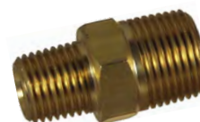
#73 Reducing Nipple