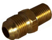
#7 Male JIC Flare Union