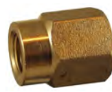
#29 Reducing Socket