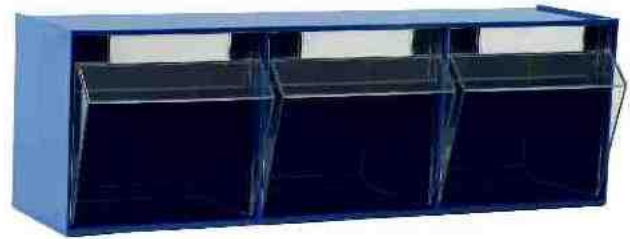
600mm x 240mm x 197mm