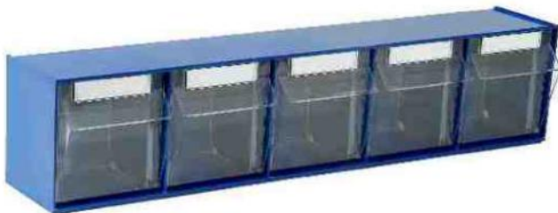
600mm x 164mm x 133mm