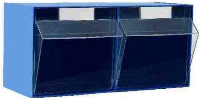
600mm x 353mm x 299mm