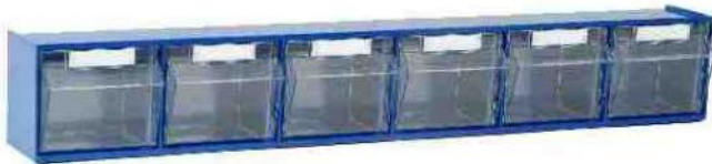
600mm x 113mm x 91mm