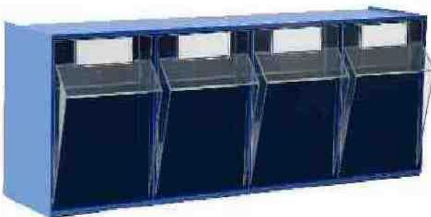
600mm x 207mm x 168mm