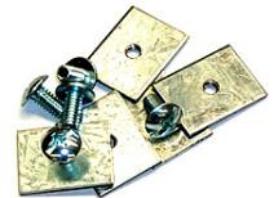
77-MSB (Bolt & Lock Set)