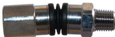
1/4 BSP M&F Ball Swivel