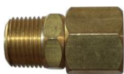
Medium Pressure Brass M&F Swivels