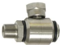
High Pressure 90 Degree Boom Swivels. 360 Degree Rotation