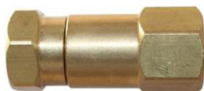
3/8 NPT Brass Female 3000 psi Swivel