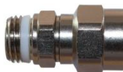
Low Pressure Nickel Plated Brass M&F Swivels