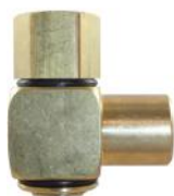
1/2 NPT Brass Female 90 Degree 3000 psi Swivel