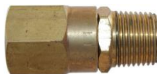
IFS Low Pressure Brass M&F Swivels