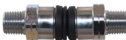
1/4 BSPT Male Ball Swivel