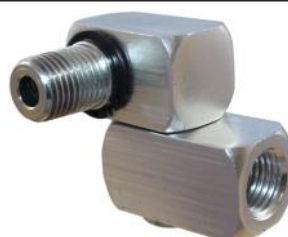
1/4 BSP M&F Swivel. Full 360° Rotation. Allows Air Hose to Drop Directly to the Floor