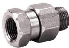
High Pressure M&F Swivels