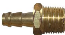
3/8 Pushlok x 1/2 NPT Male Brass Swivel