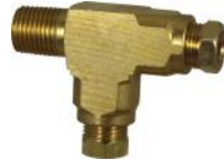
Y13 Male Run Tee