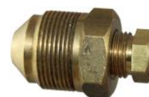
Z72A Tube Reducer