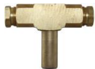
Y12A Branch Stem Tee