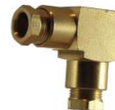
Y11 Elbow Union