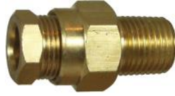
Z3 Male Connector