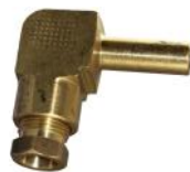
Y5A Stem Elbow