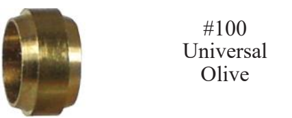
#100 Universal Olive