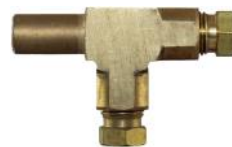
Y13A Run Stem Tee