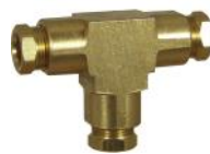
Y14 Tee Union