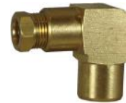
Y15 Female Elbow Connector

See Category 1 and 32 for Spigots (Tube Inserts)