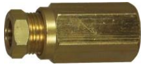
Z10 Female Connector