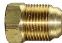
Z65 Tube Plug