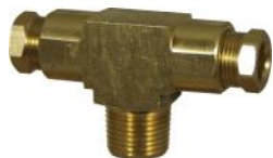
Y12 Male Branch Tee