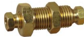
Z31 Bulkhead Union