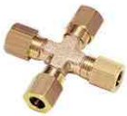
M68 Union Cross

Some sizes available. Please contact the sales office for further information.