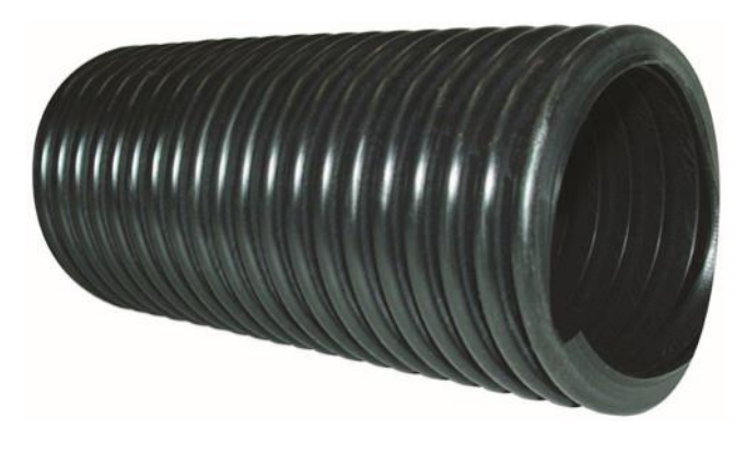
Barflo Industrial is a lightweight, flexible U.V. stabilised air seeder hose. It is also suitable for many other less demanding applications such as air and water conveyance.