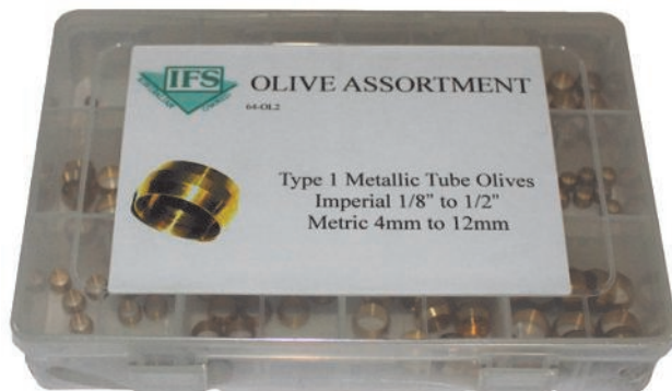
Code : 64-OL2 Type 1 Metallic Tube Olives Imperial 1/8" to 1/2" Metric 4mm to 12mm