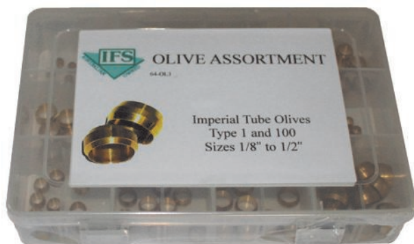
Code : 64-OL3 Imperial Tube Olives Type 1 and 100 Sizes 1/8" to 1/2"