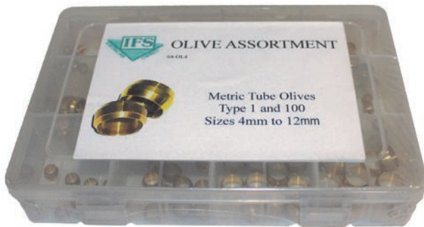
Code : 64-OL4 Metric Tube Olives Type 1 and 100 Sizes 4mm to 12mm