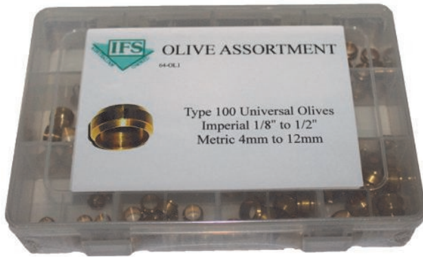
Code : 64-OL1 Type 100 Universal Olives Imperial 1/8" to 1/2" Metric 4mm to 12mm